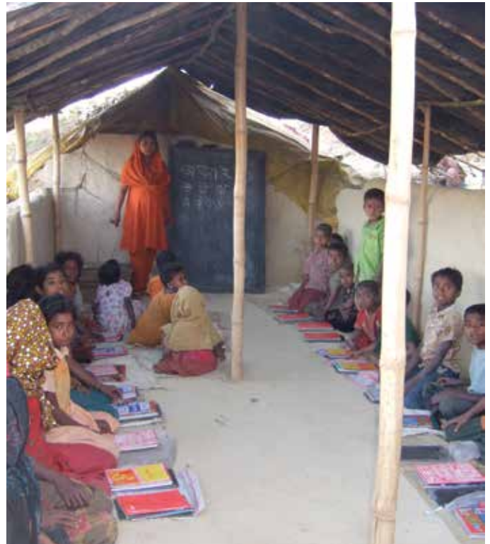
Photo: Low-profile classrooms are made of mud and sticks, woven into the structure of the make-shift camp.

After the expansion to 2,700 children, a 2015 review examined whether components were consistent with objectives, determined factors that enabled or created constraints; and highlighted areas requiring attention. An external final evaluation was conducted by an education specialist to assess impact and inform future learning.