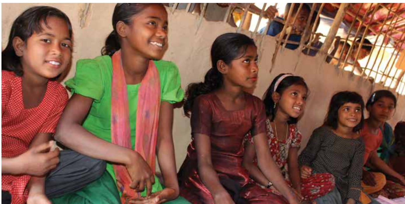
Photo: Refugee children enjoying their class.

• Classrooms made of mud were susceptible to flooding and vandalism. As a solution, many retained mud walls but were installed with concrete floors. Budgets and voluntary labour were available for repairs.